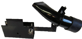
Part 4 Extension Blower Arm