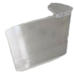
Part 9 Air Deflecting Plate