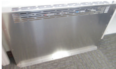
Part 13 Back Logo Panel