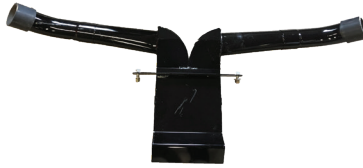
Part 2 Wind Manifold