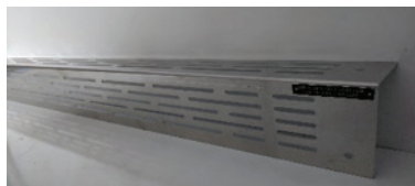
Part 19 Small Tine Reduction Vent