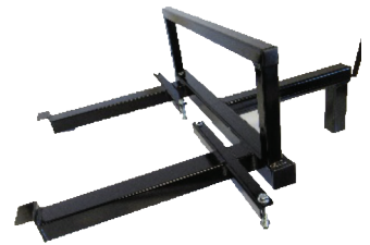
Part 6 Blower Bracket