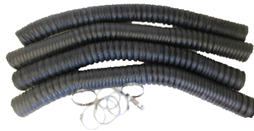
Part 8 Blower Hoses