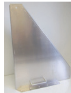
Part 14 Handle Panel