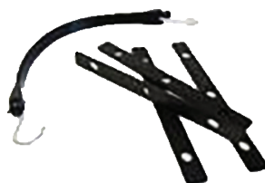
Part 11 Bungee Cord