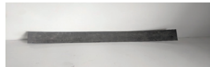
Part 20 Rubber Strip