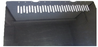
Part 3 HDPE Turf Guard Mat