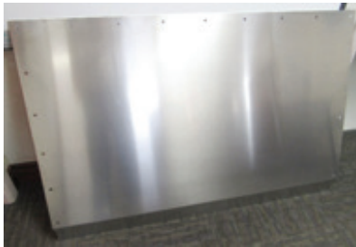
Part 12 Front Panel