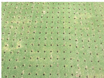
Clean Unbridged Holes