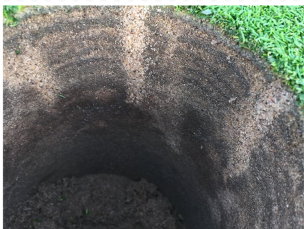
Rebuild Greens Through Aerification

- Ken Flisek, CGCS The Club at Nevillewood